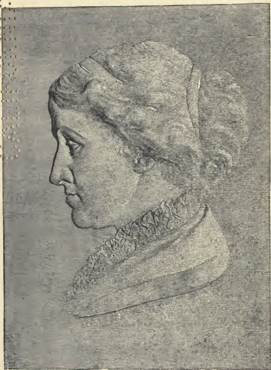
WALTON RICKETSON, SCULP.